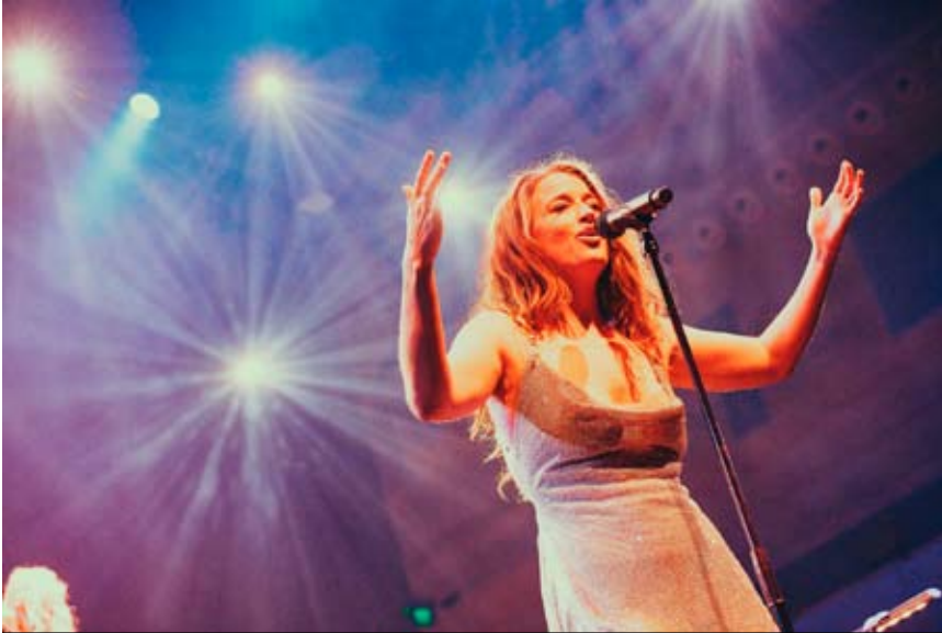
Meg Washington Live

At the heart of Meg's latest album "GEM", is this tour's namesake "Natural Beauty" - a concept that stemmed from challenging the role of an artist in society, and bringing her own world of truth and beauty to the