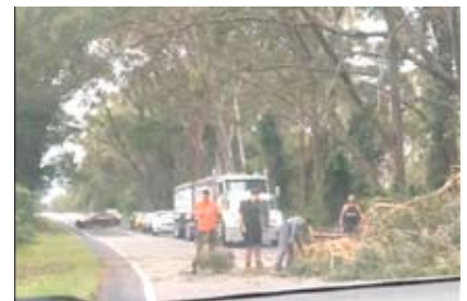
Tree cut & road cleared to allow traffic to flow again