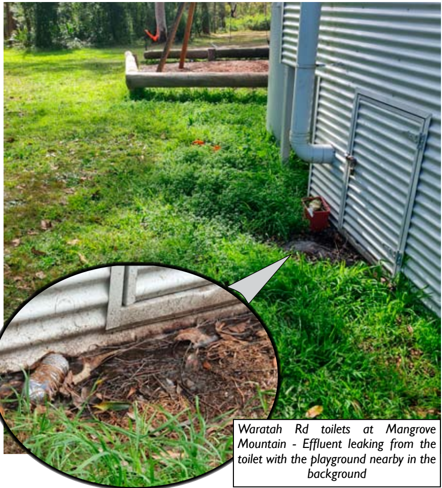
Waratah Rd toilets at Mangrove Mountain - Effluent leaking from the toilet with the playground nearby in the background

Realising that no improvements were planned for the Mangrove Mountain toilets, residents approached Council with the aim of having the existing toilets removed and replaced with a new toilet block in line with Council's