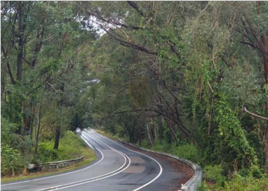
Above: October 2025 - Council inspection deemed no action required Below: December 2025 - Tree across the road at the same location

A police highway patrol was also caught up in the traffic jam and the officer was able to manage the traffic coming downhill towards the blind