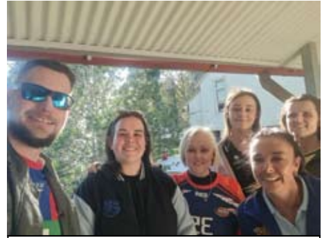
Some of the teaching staff