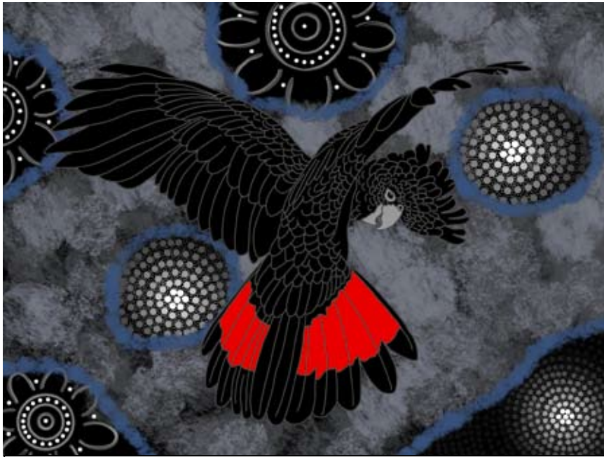
'Red-tailed Black Cockatoo' - Katie Williams