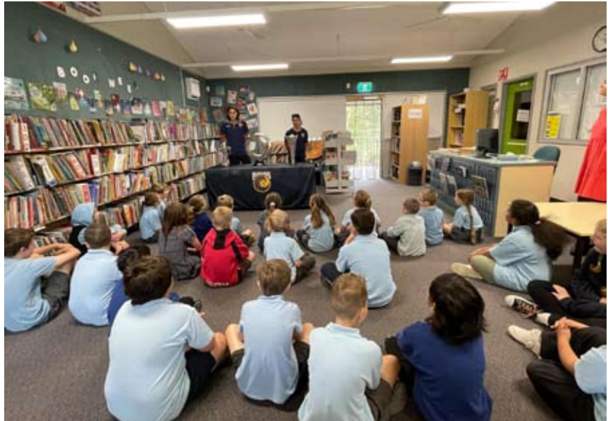
A talk in the library