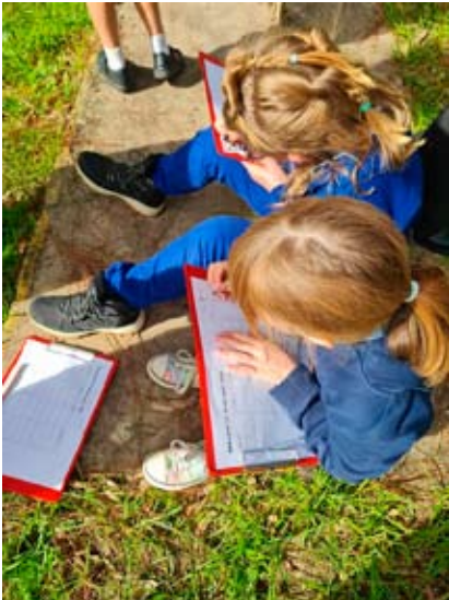
Students planning & recording in the Garden Club