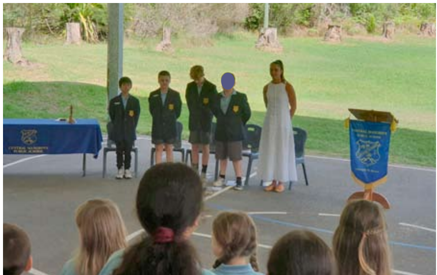
Incoming and outgoing school captains