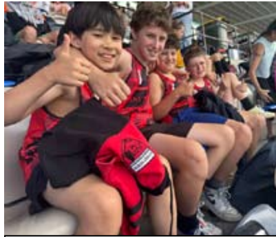
The 4 x 100m relay team at PSSA State Championships