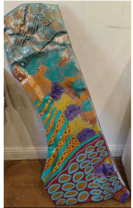
Silver Panel with River Country Elements' - Gavin Barlow

our totem is the waterhen. Please come and learn the waterhen story and meet the artists. New volunteers and artists are welcome.