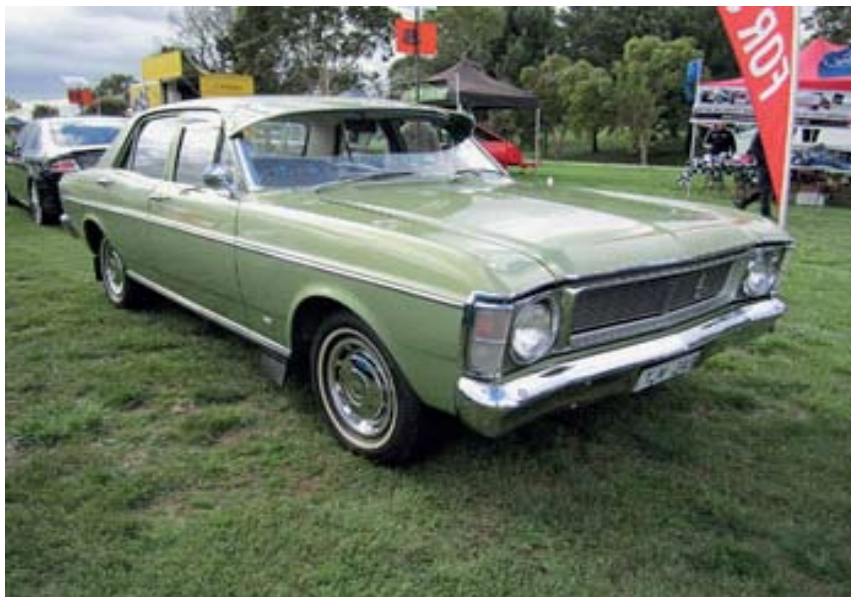
This is the model and colour of vehicle but not the actual vehicle, which was an unfinished project.

If your information leads to the apprehension and conviction of the individuals responsible , $5000 cash will be yours.