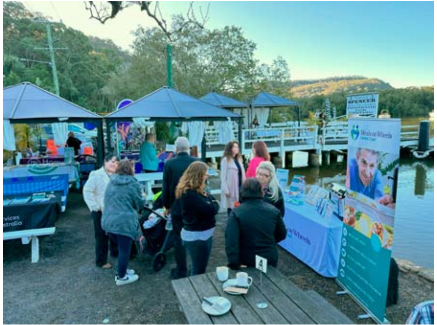
Above: Wellness Community event at the Spencer Café & Foreshore

*50 years or over for Aboriginal and Torres Strait Islander people