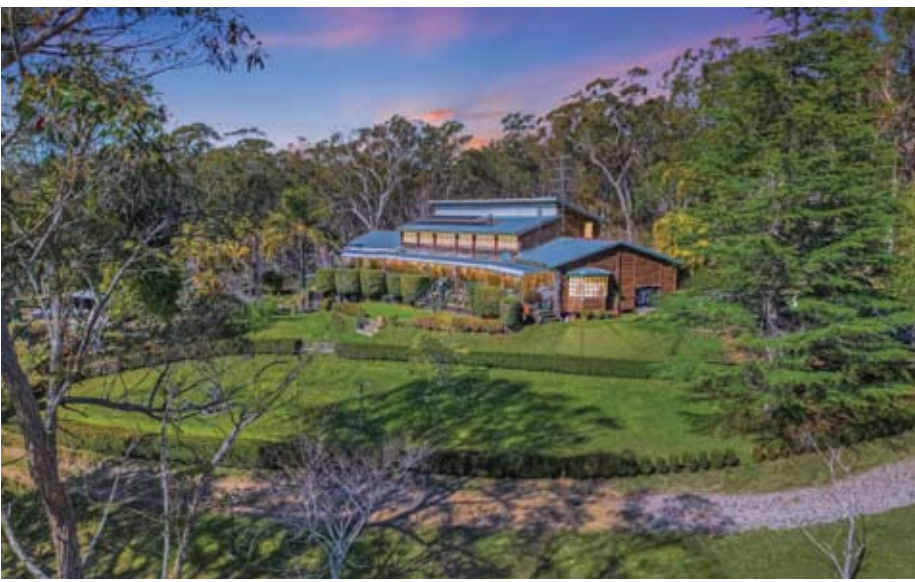
Kulnura - 178 Greta Road, SOLD - $2,135,000 10 4 12