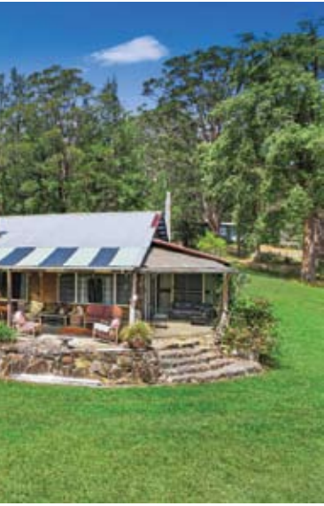
ad SOLD - $1,220,000