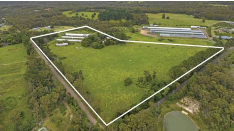
Mangrove Mountain - 150 Niclins Road SOLD - $1,500,000 3 1 2