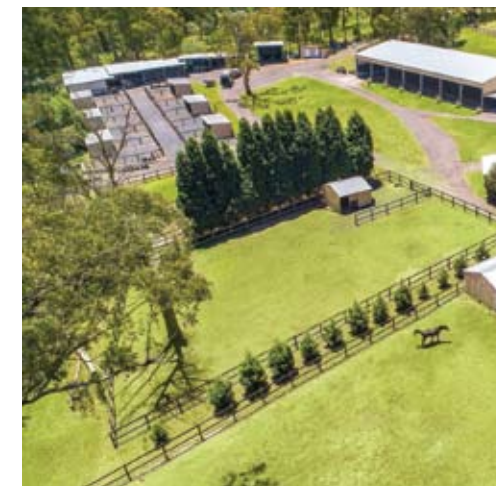
Somersby - 24 Konda Road 6 4 8