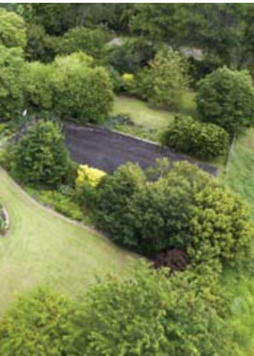
ad SOLD - $2,625,000