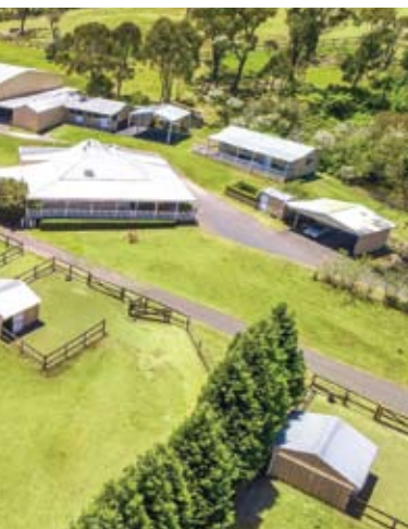
SOLD - $5,400,000