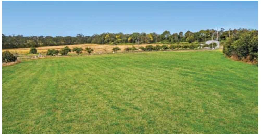
Kulnura - 520 George Downes Drive SOLD - $1,050,000