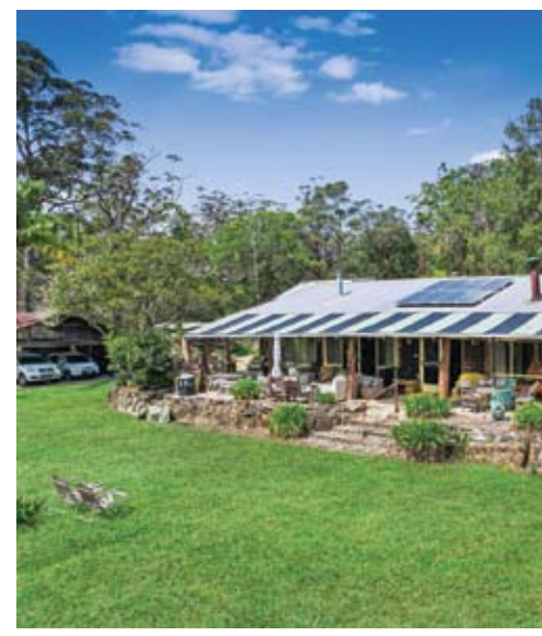
Murrays Run - 1517 Murrays Run Road 4 4 5