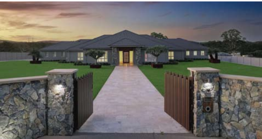
Wyee - 60 Webber Road SOLD - $3,300,000 9 1 7 11