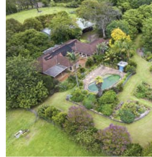
Mangrove Mountain - 41 Goolara Road 14 4 10