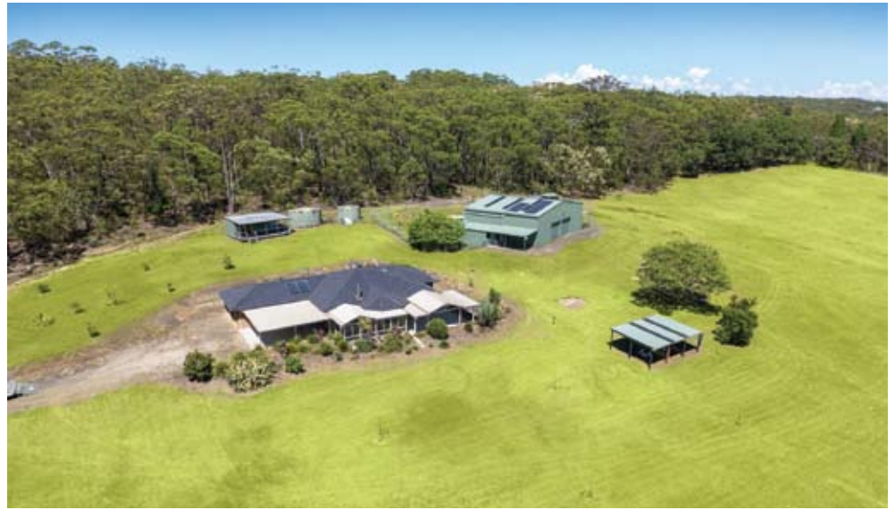
Kulnura - 156 Yorky Waters Road SOLD - $1,900,000