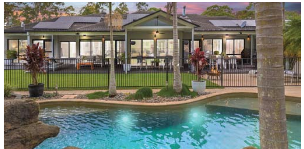
Jilliby - 60 Burlington Avenue SOLD - $2,050,000