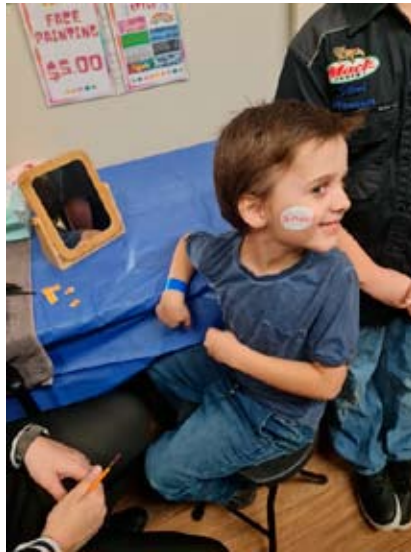
Above: Check out the tattoo