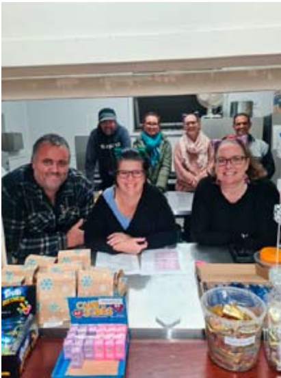
Above: the CMPS P&C team Below: Limbo dancing

Next term our Year 1 and Year 2 students will begin engaging the InitialLit program, an evidence-based synthetic literacy program which teaches phonics alongside a rich literature and vocabulary component to further provide all children with the essential core knowledge and strong