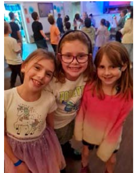
Above: Three Amigos Below: Three Amigos II