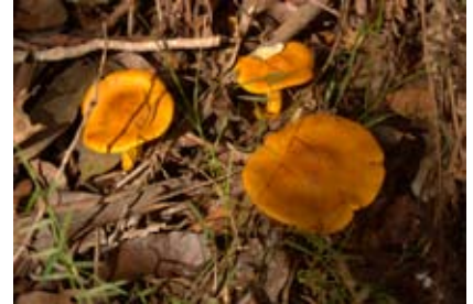
Top: Amanita muscaria Above: orange capped mushrooms Below: Lantana ( Lantana camara )