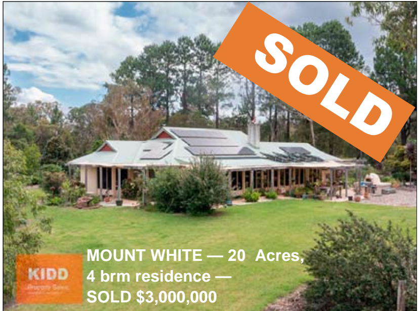
KIDD MOUNT WHITE — 20 Acres, 4 brm residence — SOLD $3,000,000

Selling in this market requires a different approach from the normal Agent's way of thinking. It takes more than expensive glossy pamphlets, retouching photos (that don't honestly represent the property, making buyers loose trust) and expensive marketing packages YOU HAVE TO PAY FOR — what It requires is tenacity, endurance, a creative approach to selling, and above all working hard with buyers to get a sale and at the highest possible price.