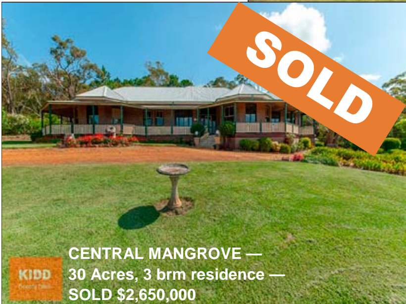
KIDD CENTRAL MANGROVE — 30 Acres, 3 brm residence — SOLD $2,650,000

Selling 21% of all properties sold by agents, followed by the next competitor based out of area at 21%, the remaining 6 agents which are also based out of area share the balance of 68% of sales.*