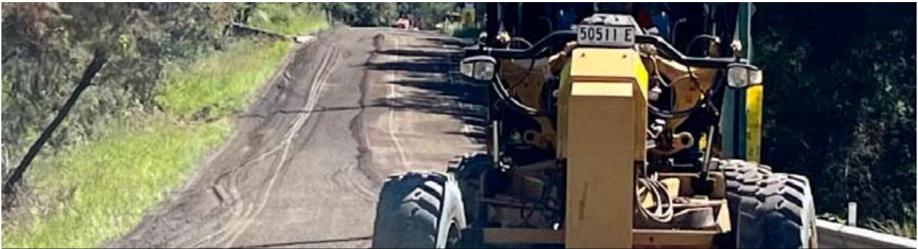
Road pavement work at Debenham Rd South, West Gosford