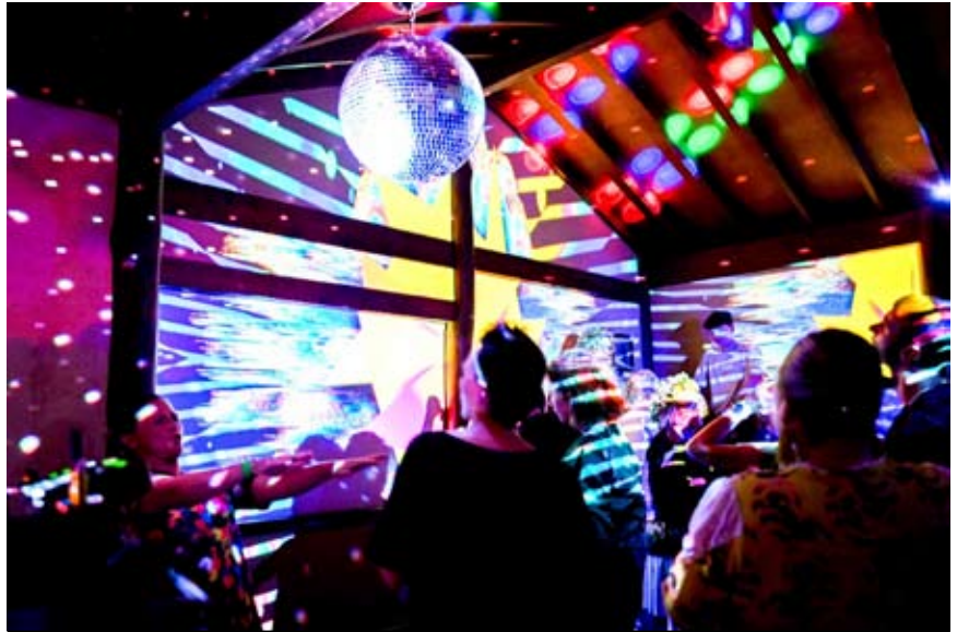
Colour, Light & Music

Festival Producer Glitta Supernova stating for 2024 the ideas are big, bright, bold and set to work their magic across Gosford gardens, multi locations within the gardens will shine