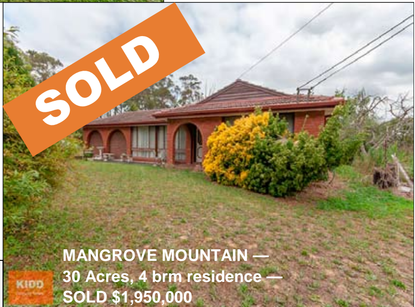
KIDD MANGROVE MOUNTAIN — 30 Acres, 4 brm residence — SOLD $1,950,000