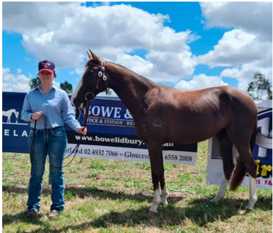
Top Priced Mare: Tocal Ularne, $19,000