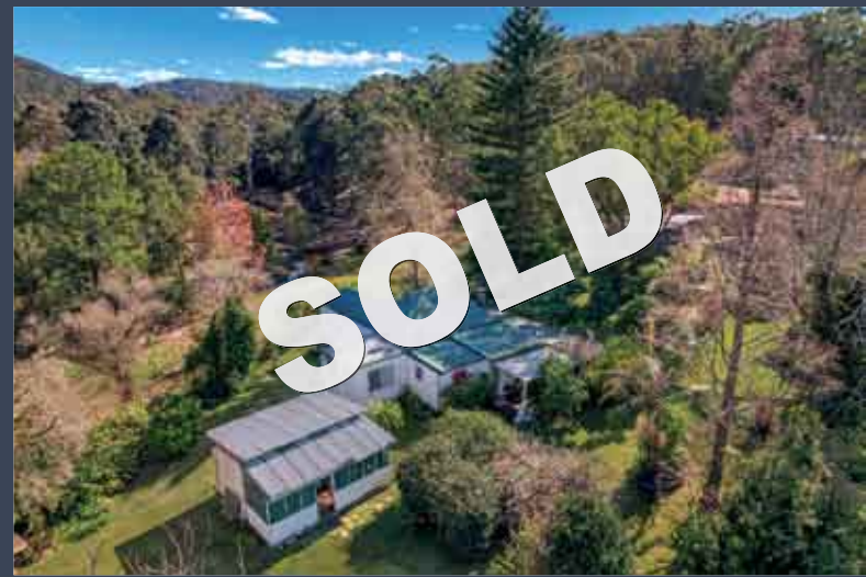
28 Old Maitland Road, Kangy Angy $1,350,000