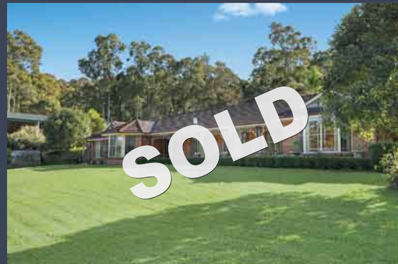
220 Wye Farms Road, Wye $2,800,000