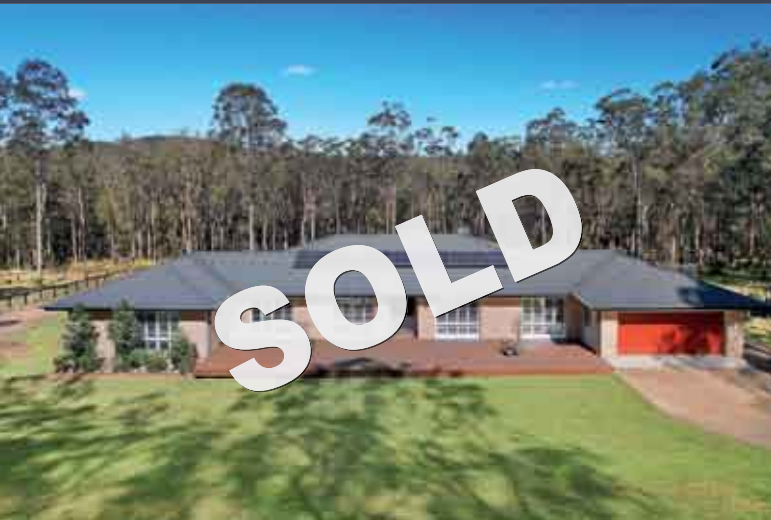
120 Dooralong Ridge Road, Dooralong $2,000,000