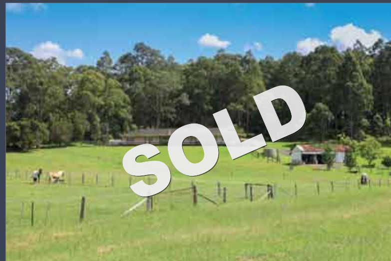
226 Jilliby Road, Jilliby $2,000,000

Real Estate Wyong. Servicing the Central Coast.