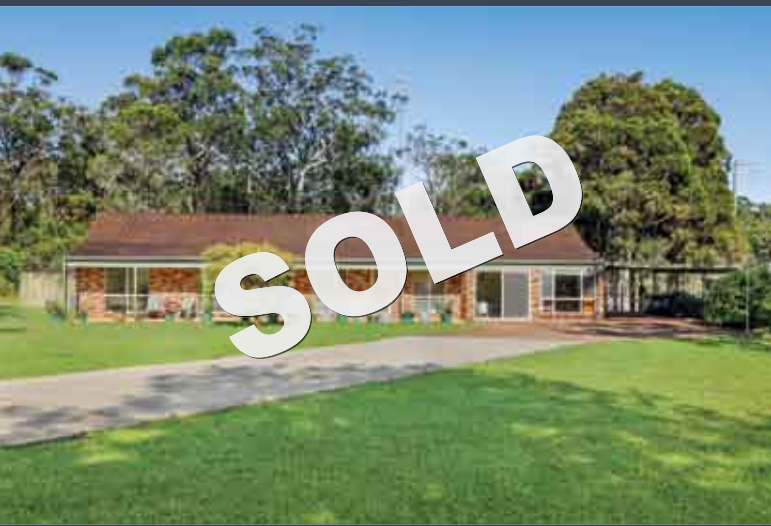
5 The Downs, Jilliby $1,500,000