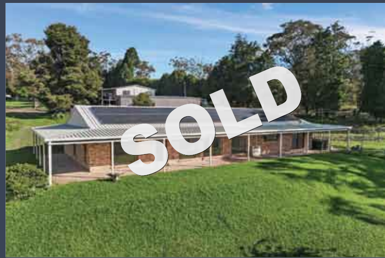
1732 Wisemans Ferry Road, Central Mangrove $1,950,000