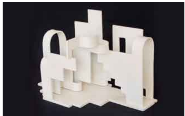
Wollombi Valley Arts Council Inc. Email: artscouncil@wollombi.org