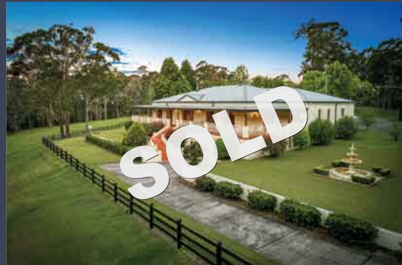
348 Pacific Highway, Kangy Angy $3,340,000