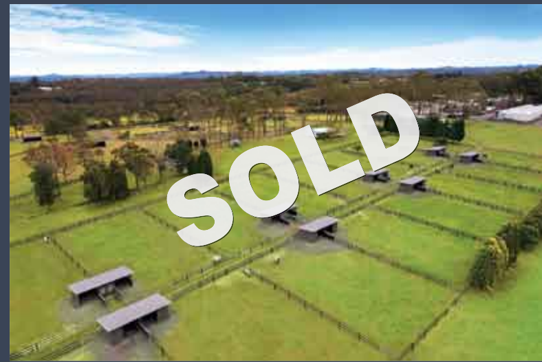
1409 Peats Ridge Road, Peats Ridge $4,500,000