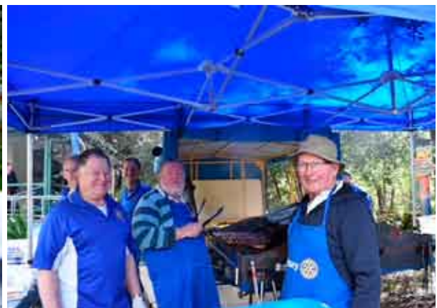
Kariong-Somersby Rotary ran the BBQ