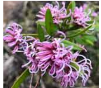
Above left: Dillwynia spp, Above right: Grevillea sericea Left: Bagging the whiskey grass weeds - kids welcome! Below: Platysace linearifolia (white one)