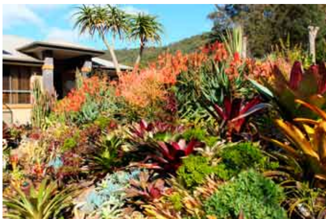
Bromeliads