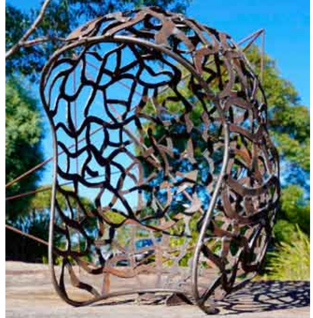
"Don't lose your grip" by sculptor, painter, art conservator, former Mental as Anything bass player and Wollombi local Stephen Coburn references the dangers of the winding road through the Wollombi valley, beloved of motorcyclists.