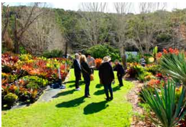
Happy Wanderers (Ross Morrison)