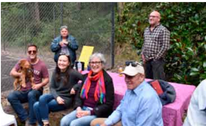
Locals enjoying the afternoon after the meeting

To avoid 'rubber neckers' road blocks should have been installed