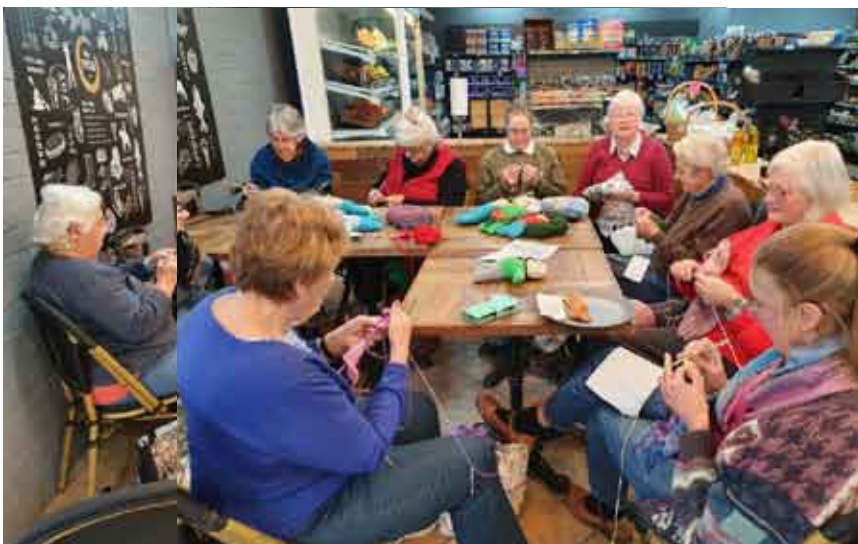
MANGROVE MOUNTAIN BEAR PATTERN – ONE PIECE