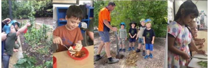
The snake room children helping in the garden and cooking curry for Diwali