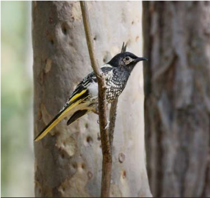
Regent Honeyeater

“We have worked with a number of landholders to restore Swamp Sclerophyll Forest on Coastal Floodplains, a Threatened NSW Ecological Community. These sites were selected due to their proximity to recent Swift Parrot sightings.