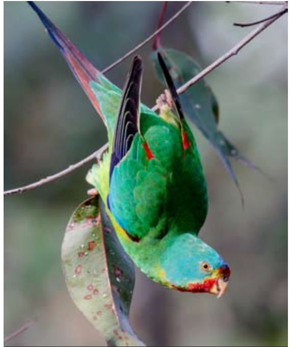
Swift Parrot (Mick Roderick)

You can view the webinar via https://vimeo.com/599510135 (using Google Chrome for the best viewing